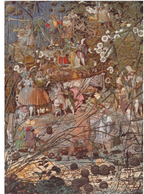
The Fairy Feller's Masterstroke, Richard Dadd

Regarding the use of the term, Anthropocene; it is a slang term for the decline of the planet in our lifetime. Our current epoch is called the Holocene, which began 11,700 years ago after the last major ice age. As we become more aware of the speed of climate change and the vast extinction of species that is occurring, some scientists think we have entered an entirely different era when human activity is having a great impact on carbon and methane in the Earth's atmosphere. They suggest this is the beginning of the new Anthropocene era dating to 1945 when humans tested the first atomic bomb.